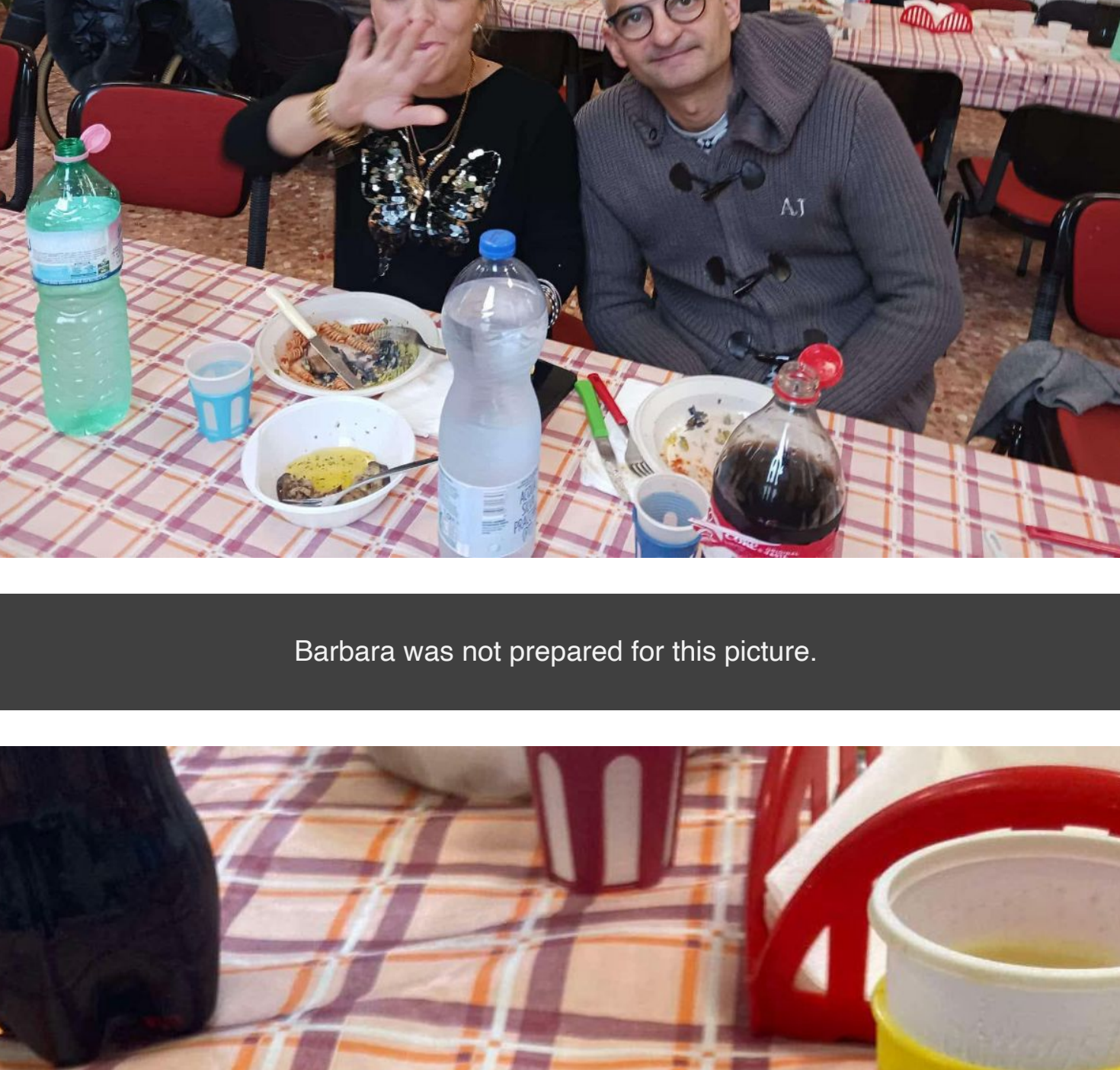
We had a real east meets west thing going on.