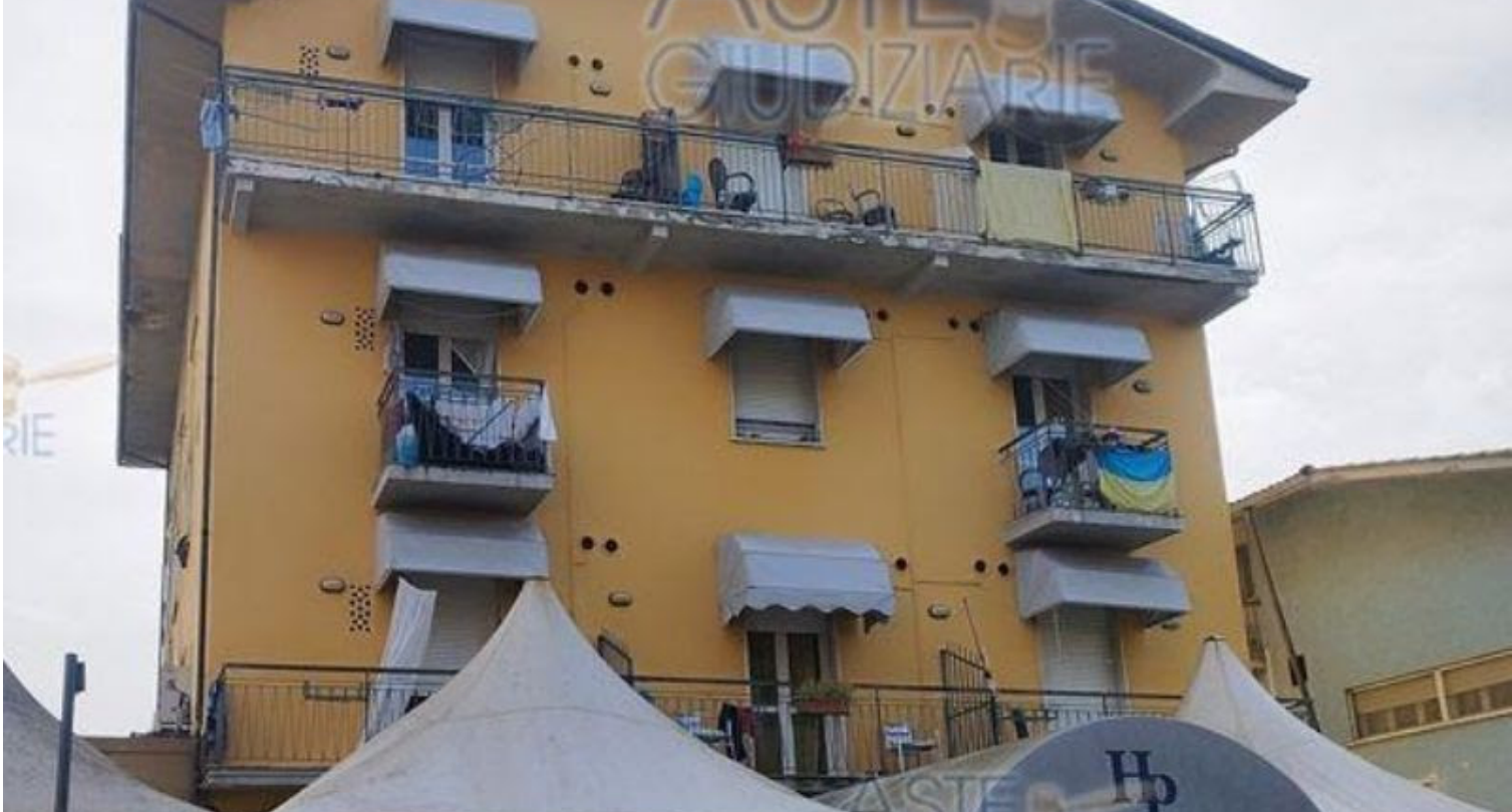
The hotel where I found the refugees.

I am going back on Friday of this week to see if I can set up Bible studies. It seems like there are at least a hundred refugees in these two hotels and, perhaps, they will have an interest in the Gospel. I am assuming there are more that I have not seen. Please pray that I will be able to set up studies there, and that they will bear fruit.