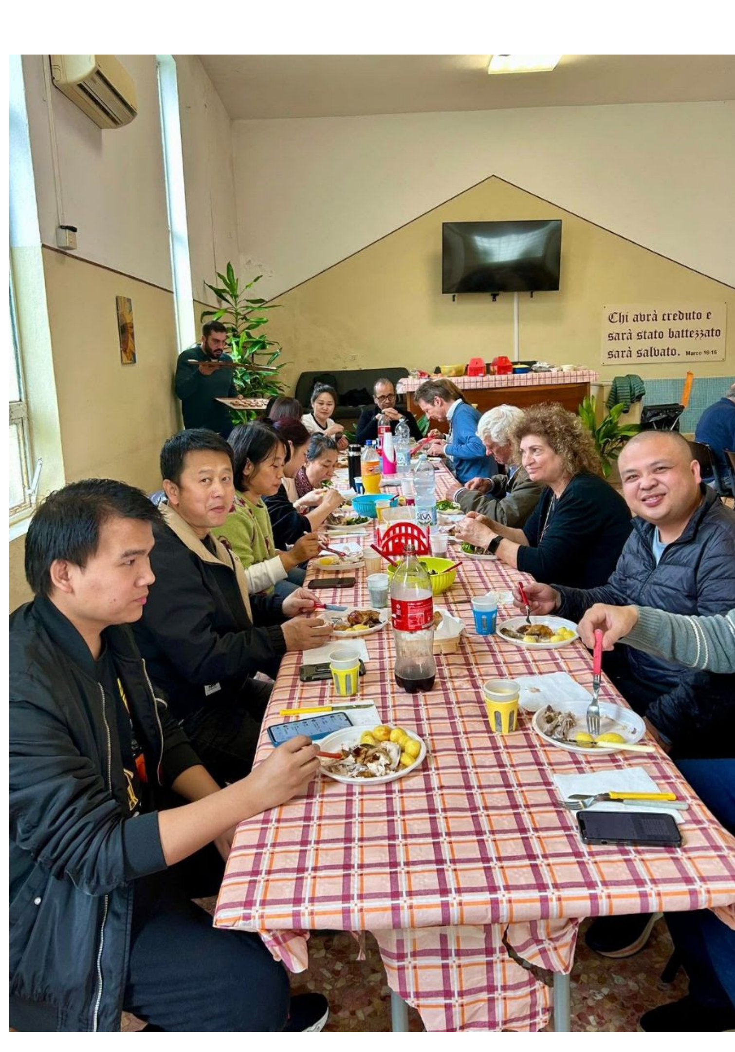
Some of our Chinese students at a recent potluck.

Please continue to pray for these efforts.